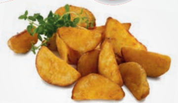
Wedges 60 sec.