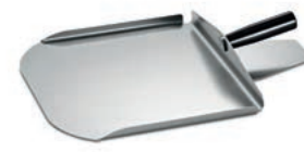
Guarded paddle with supporting side walls