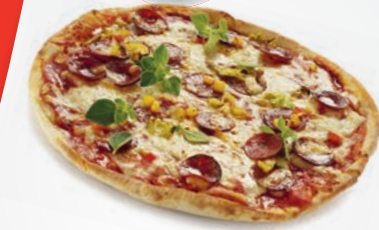
Pizza 50 sec.