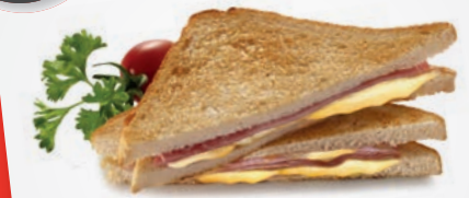
Toasted Sandwich 40 sec.