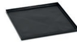
Solid base basket