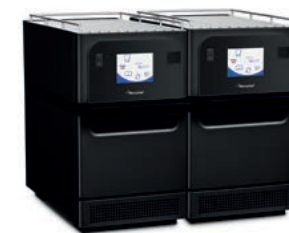
Adaptor for eikon® e2s Twin