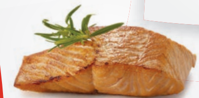
Salmon Steak 70 sec.