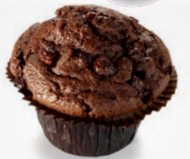
Reheated Muffin 30 sec.