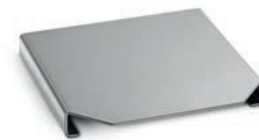
Flat cook plate