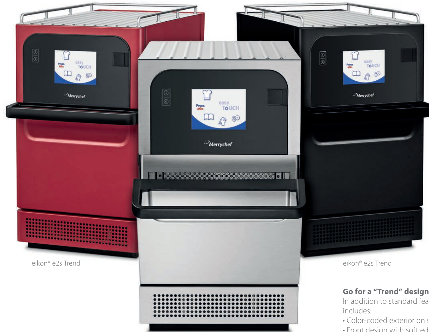
eikon® e2s Trend