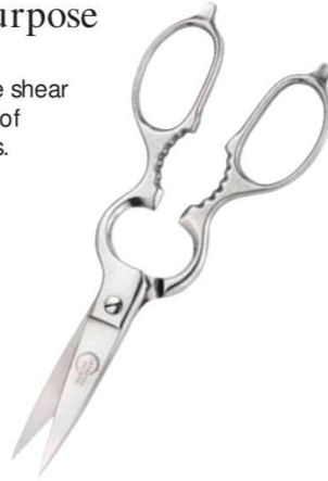
M14802 8" Overall

All-around performance shear for a variety of kitchen tasks.