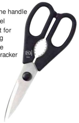
M33042P 8" Overall