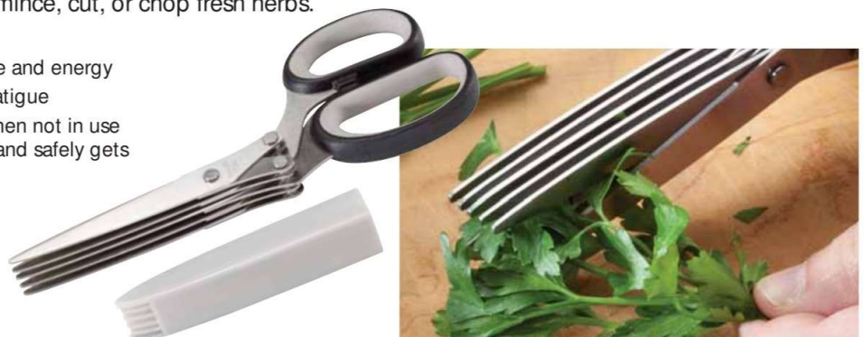
M35150 7.6" Overall