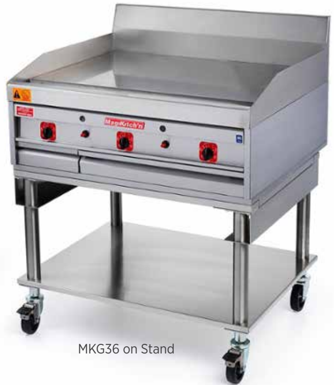
MKG36 on Stand