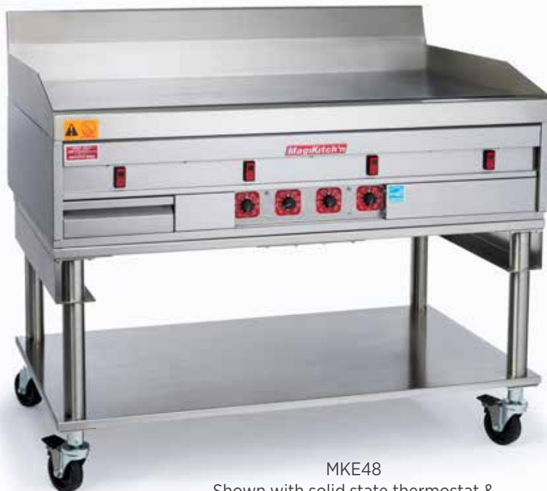
MKE48 Shown with solid state thermostat & left grease trough