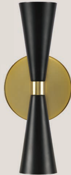
310422 BVB 2 LIGHT ADA WALL SCONCE W: 5 H: 12 E: 4 (2) 3W G9 LED (INCLUDED)