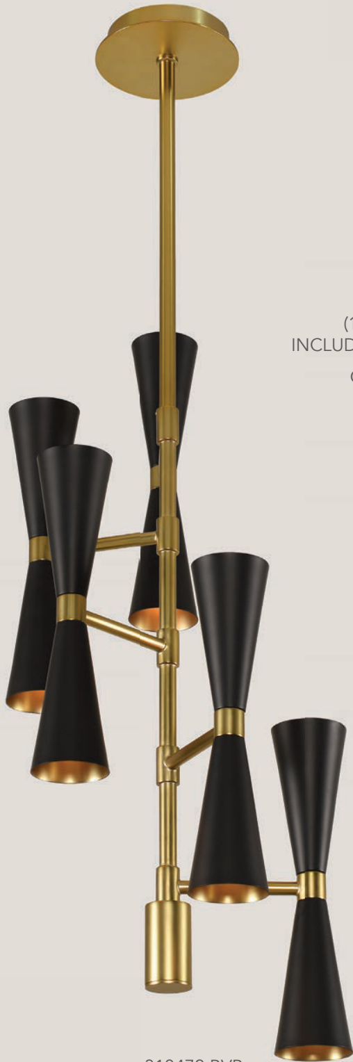
310472 WVB 5 ARM (10 LIGHT) FOYER D: 13 H: 30 OAH: 68 (10) 3W G9 LED (INCLUDED) INCLUDES (2) 6", (2) 12" & (2) 24" STEMS G9 LED LAMPS INCLUDED