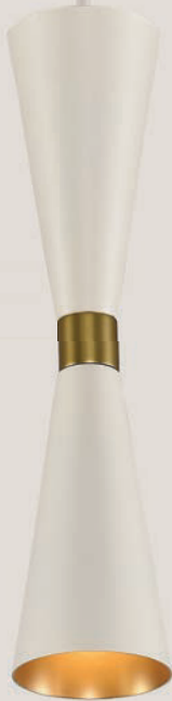
310410 WVB 1 LIGHT MINI PENDANT D: 3 H: 12 OAH: 87 (1) 3W G9 LED (INCLUDED)