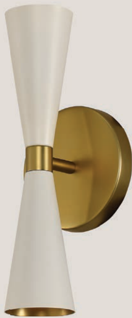
310422 WVB 2 LIGHT ADA WALL SCONCE W: 5 H: 12 E: 4 (2) 3W G9 LED (INCLUDED)