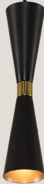
310410 BVB 1 LIGHT MINI PENDANT D: 3 H: 12 OAH: 87 (1) 3W G9 LED (INCLUDED)