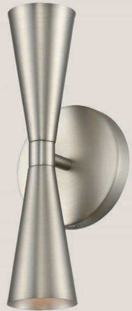
310422 SN 2 LIGHT ADA WALL SCONCE W: 5 H: 12 E: 4 (2) 3W G9 LED (INCLUDED)