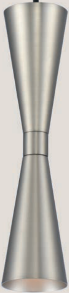
310410 SN 1 LIGHT MINI PENDANT D: 5 H: 12 OAH: 107 (1) 3W G9 LED (INCLUDED)