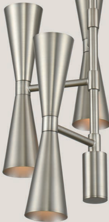
310472 SN 5 ARM (10 LIGHT) FOYER D: 13 H: 38 OAH: 116 (10) 3W G9 LED (INCLUDED) INCLUDES (2) 6", (2) 12" & (2) 24" STEMS