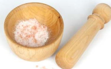
Mortar & Pestle MORTPSTL01 | MSRP: $9.95