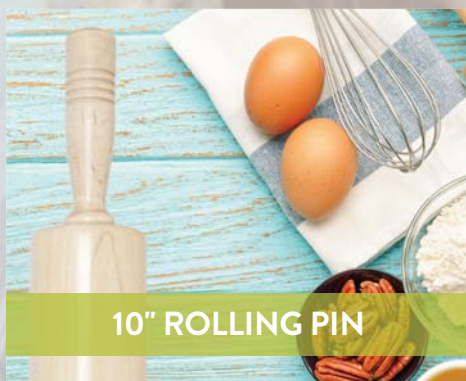
10" ROLLING PIN

This 2.8" diameter round Biscuit Cutter features a sharp edge to make biscuits like your grandmother used to. See it on page 17.