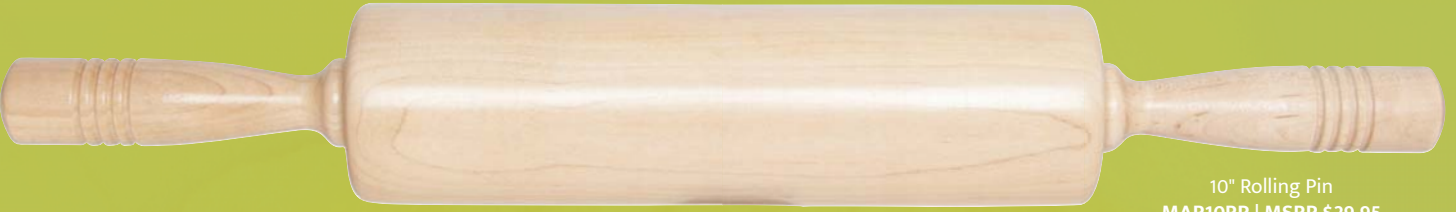
10" Rolling Pin MAR10RP | MSRP $29.95