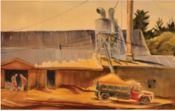
Old Fletchers' Mill - watercolor by Joe Park - 1984