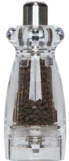
Acrylic Pump & Grind PUMPACRYLIC | $19.95