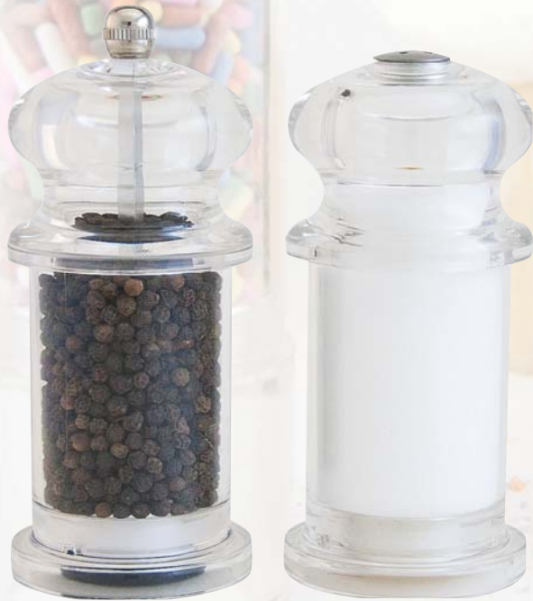
Denali Acrylic Pepper Mill & Salt Shaker Set DEN05SET02-SS | MSRP: $16.95