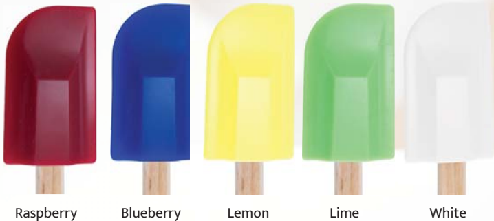
Raspberry Blueberry Lemon Lime White