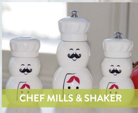
CHEF MILLS & SHAKER

Our salute to the hardworking farmers, our new Silo mills are 7" tall, and just like the good old days is built to last a lifetime. See it on page 12.