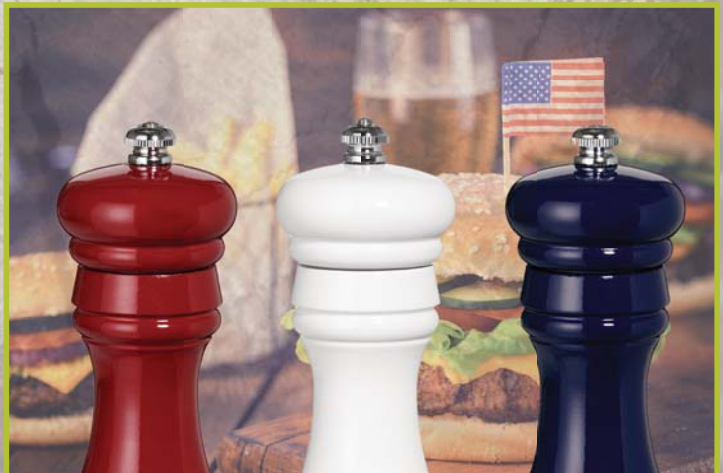
Federal Pepper Mills - see page 7