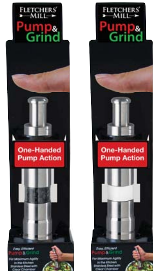
Pump & Grind Retail Packaging