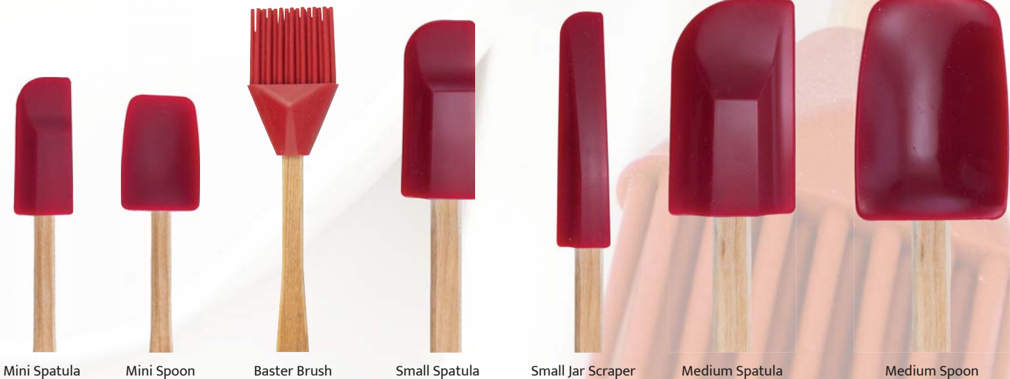
Mini Spatula Mini Spoon Baster Brush Small Spatula Small Jar Scraper Medium Spatula Medium Spoon