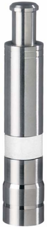
Pump & Grind - Salt STS06SM01 | MSRP: $24.95