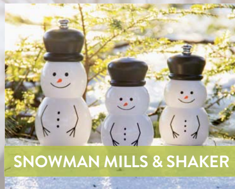
SNOWMAN MILLS & SHAKER

The new Vineyard Collection is available in 5", 7" and 9" sizes and features 2 new finishes: Antique White & Antique Cherry. See the Vineyard Collection on page 10.