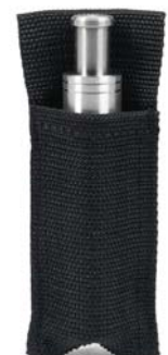
Belt Holster (mill not included) HOLSTER1 | MSRP: $4.95