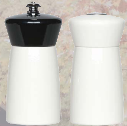
White w/Black Top