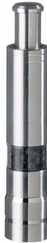
Pump & Grind - Pepper STS06PM01 | MSRP: $24.95