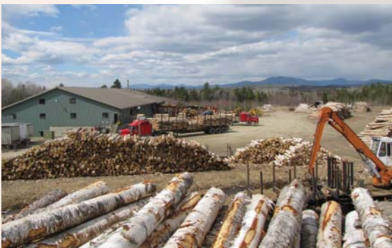
Maine Wood Concepts Sawmill