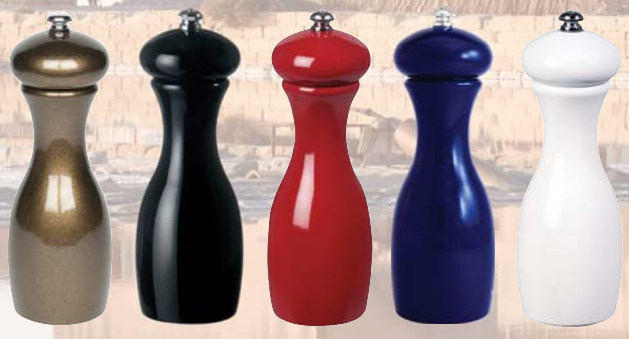
Metallic Bronze Black Cinnabar Cobalt White