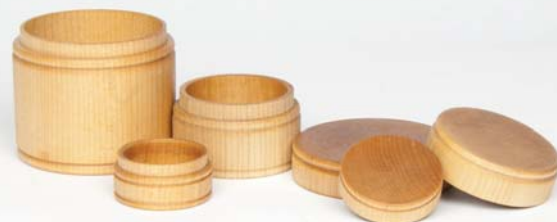
Nesting Boxes NESTBOX01 | MSRP $9.95