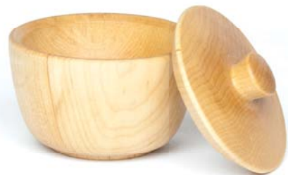
Large Condiment Cup with Lid CONCUP-LG-LID | MSRP: $9.95