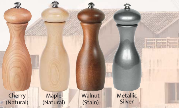
Cherry (Natural) Maple (Natural) Walnut (Stain) Metallic Silver