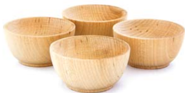
Small Condiment Cups: Set of 4 CONCUP01 | MSRP: $8.95