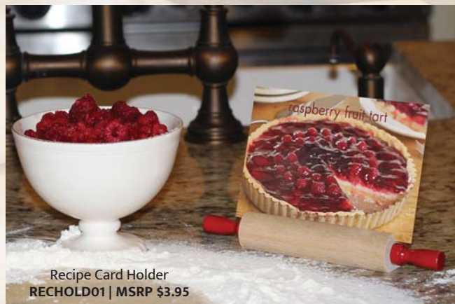
Recipe Card Holder RECHOLD01 | MSRP $3.95