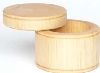
Salt Cellar SALTCELL01 | MSRP $14.95