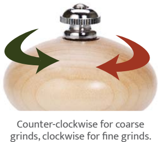
Counter-clockwise for coarse grinds, clockwise for fine grinds.

Fletcher's Mill pepper mills are fitted with a stainless steel two-step mechanism which first cracks the peppercorns to release their natural oils and flavors, and then grinds the peppercorns to your chosen consistency. Fletcher's Mill salt mills have an adjustable nylon crushing system. And, our pepper and salt mill mechanisms include a LIFETIME GUARANTEE. Pepper mills can only be used for pepper and salt mills can only be used for salt.