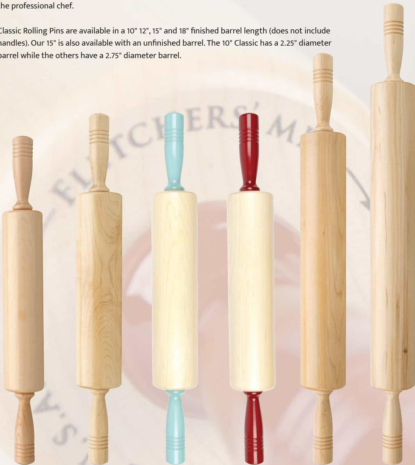
10" Classic Rolling Pin 210RP12 MSRP $24.95

Classic Rolling Pins are available in a 10" 12", 15" and 18" finished barrel length (does not include handles). Our 15" is also available with an unfinished barrel. The 10" Classic has a 2.25" diameter barrel while the others have a 2.75" diameter barrel.