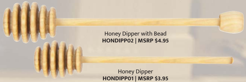
Honey Dipper with Bead HONDIPP02 | MSRP $4.95