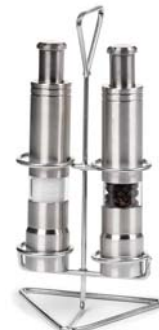
Tabletop Stand (mills not included) PGSTAND | MSRP: $19.95