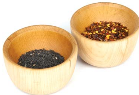
Large Condiment Cups: Set of 2 CONCUP-LG | MSRP: $9.95