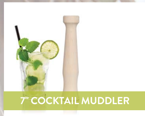
7" COCKTAIL MUDDLER

Add some fun and function to your kitchen with our new Chef Mills, complete with mustache and chef's hat. See the chefs on page 13.