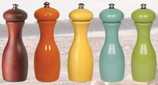
Mahogany (Stain) Orange Goldenrod Mare Cypress