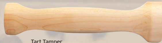
Tart Tamper TARTTAMP01 | MSRP $3.95 NEW LOWER PRICING