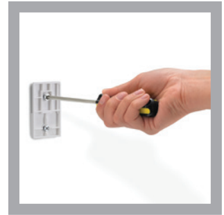
Screw wall mount