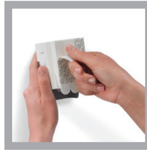
Adhesive wall mount

The PURELL ES™ Everywhere System offers four mounting options to provide the utmost versatility for every placement need.