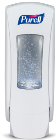
PURELL® ADX-12™ Dispenser