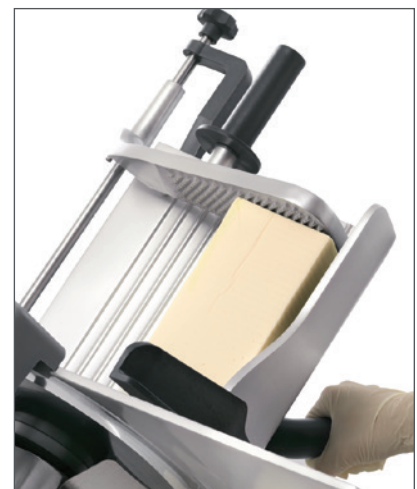
Cheese doesn't shred; it slices evenly.

Call 1-888-4HOBART or visit www.hobartcorp.com .