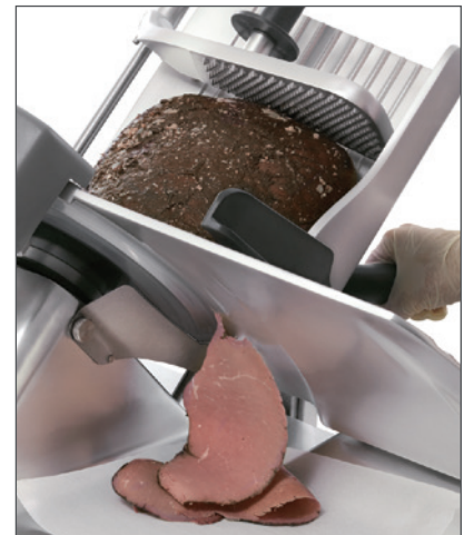
Even oversized loaves fit easily.