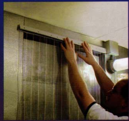
SNAP THE CAP SHUT