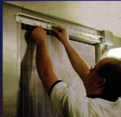
HANG PVC STRIPS