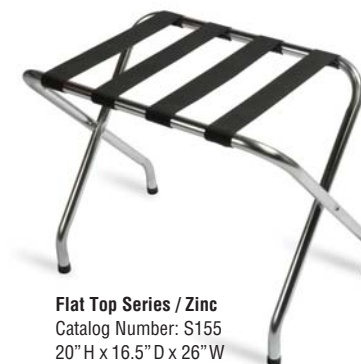
Flat Top Series / Zinc Catalog Number: S155 20" H x 16.5" D x 26" W