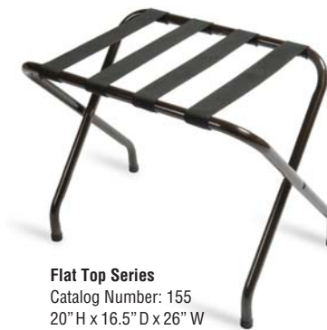
Flat Top Series Catalog Number: 155 20" H x 16.5" D x 26" W