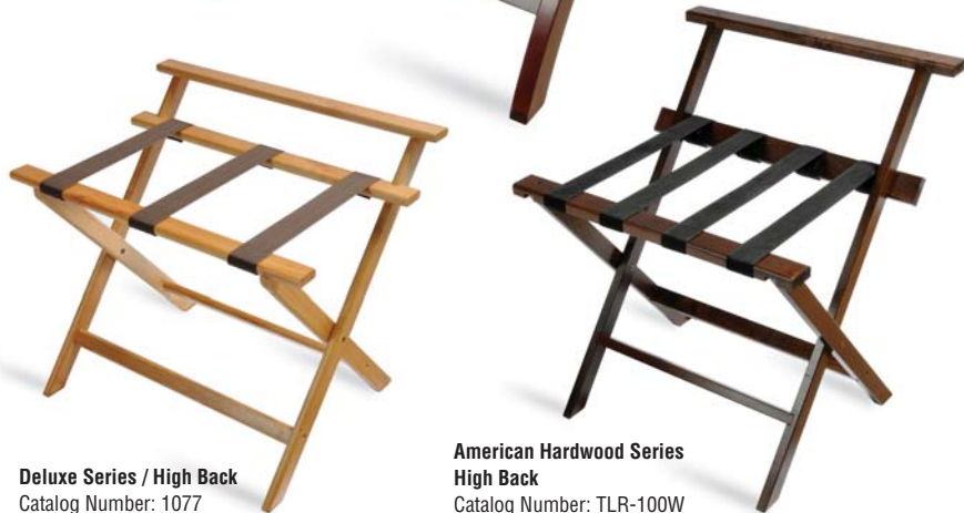
Deluxe Series / High Back Catalog Number: 1077 22.5" H x 18.5" D x 26" W