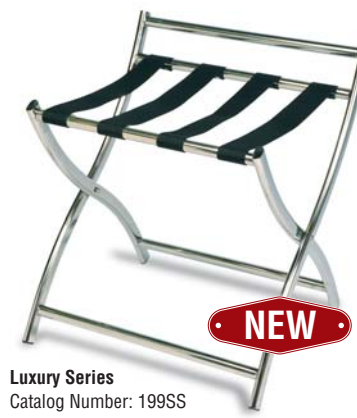
Luxury Series Catalog Number: 199SS 22.5" H x 18.5" D x 19.5" W