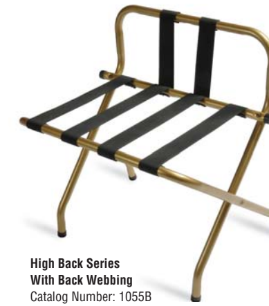
High Back Series With Back Webbing Catalog Number: 1055B 26.5" H x 16" D x 24.25" W