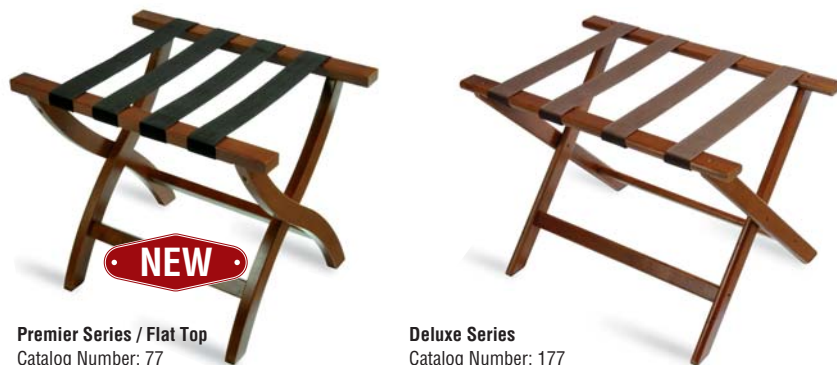
Premier Series / Flat Top Catalog Number: 77 19.25" H x 17" D x 23" W