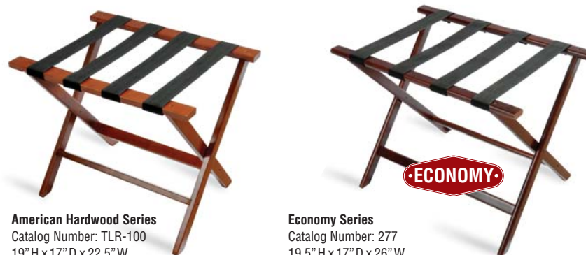
American Hardwood Series Catalog Number: TLR-100 19" H x 17" D x 22.5" W