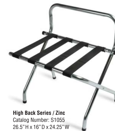
High Back Series / Zinc Catalog Number: S1055 26.5" H x 16" D x 24.25" W