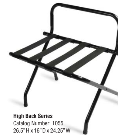
High Back Series Catalog Number: 1055 26.5" H x 16" D x 24.25" W