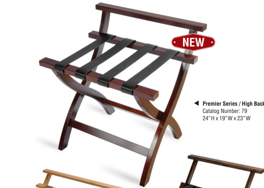
◀ Premier Series / High Back Catalog Number: 79 24" H x 19" W x 23" W