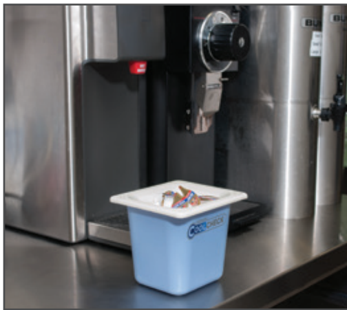
Works great in a variety applications, including keeping coffee creamers cool for the morning rush