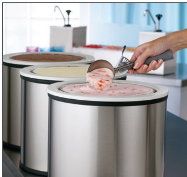
CM1012 with 38655 Shroud

NSF Listed products are designated with a \Delta