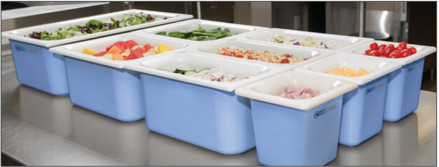
Mix and match sizes for the perfect setup