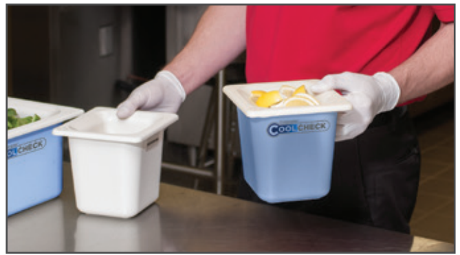
Easily swap out pans when they turn white