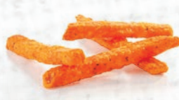
CLEAR COAT 9/16" X 7/16" SWEET POTATO FRIES JERSEY SHORE™ 55776 00051