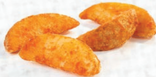
FLAVOURCRISP® SPICY WEDGE - PRIME CUT 56210 05718