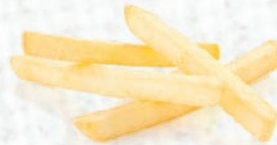
FINE COAT™ 7/16" STRAIGHT CUT, SKIN-ON 56210 07760