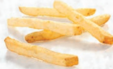
CLEAR COAT 7/16" STRAIGHT CUT - SKIN ON 56210 05312