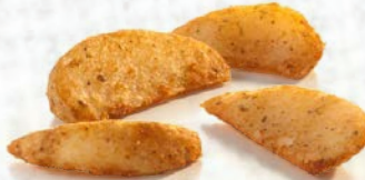
FLAVOURCRISP® GARLIC & ROSEMARY WEDGE - PRIME CUT 56210 37227