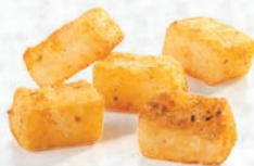
FLAVOURCRISP® SEASONED SMALL DICED - SKIN-ON 56210 05999