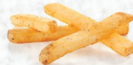
FLAVOURCRISP® 9/16" X 7/16" SEASONED FRIES - SKIN-ON JERSEY SHORE™ 55776 00050