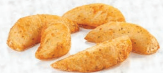
FLAVOURCRISP® SEASONED WEDGE - REGULAR CUT 56210 05998