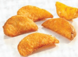
FLAVOURCRISP® POTATO WEDGE - SPICY 56210 14504