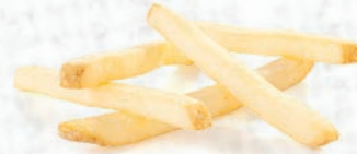
FINE COAT™ 3/8" STRAIGHT CUT, SKIN-ON 56210 07750