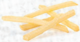
CLEAR COAT 9/32" SHOESTRING 56210 05313