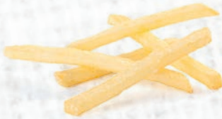
FINE COAT™ 9/32" SHOESTRING 56210 07710