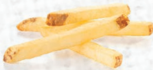
FINE COAT™ 7/16" STRAIGHT CUT 56210 07720