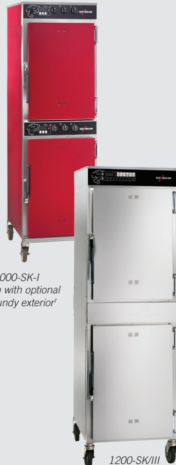
1000-SK-I shown with optional burgundy exterior †