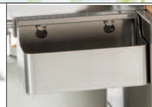
Spice & Utility Rack Ice & Sauce Bucket