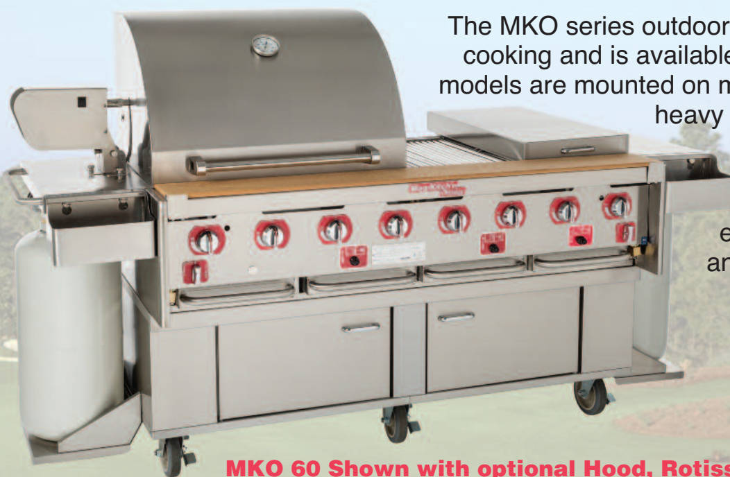
MKO 60 Shown with optional Hood, Rotisserie, Spice & Sauce Racks, Side Burner & Cover

The MKO series outdoor suites offer high production cooking and is available in three sizes. All standard models are mounted on mobile tank/storage cart with heavy duty swivel casters for easy mobility. This allows the cooking suite to be transportable to any event location. Many options and accessories are available to tailor your suite to match your menu selection and operational needs.