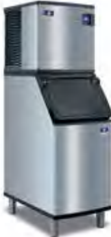
IT0620 D-420 Bin