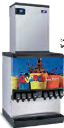
Ice/Beverage Series on Beverage Dispenser