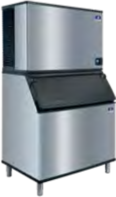
IT1900 D-970 Bin