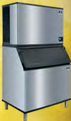
IT1500 D-970 Bin