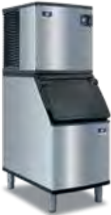
IT0420 D-320 Bin