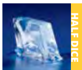
Available on all undercounters

These compact ice cube machines are ideal for small-volume ice production, for limited-use needs, or as back-ups for larger machines. Specifically designed to fit beneath counters or in areas where floor space or height restrictions prohibit use of larger equipment. The petite size makes any of these models ideal for on-the-spot installations at coffee shops, stadium boxes, refreshment/break areas, or wherever limited ice needs require equipment with a small footprint.