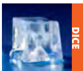
Available on all undercounters