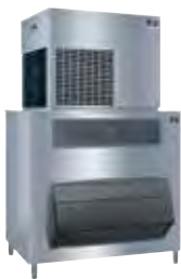
RFF2500 F-1650 Bin