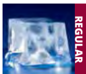
Available on UF0140 and UF0310