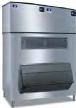
CVD Condensing Unit***