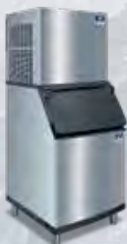
RFF1300 D-570 Bin