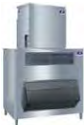
RFF2200C F-1650 Bin