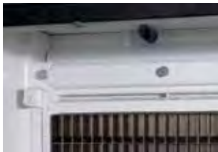
Ice machine equipped with LuminIce II