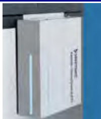
iAuCS (External Mounting)

iAuCS counts the number of ice-making cycles and, at a frequency you select, initiates a cleaning or sanitizing cycle... AUTOMATICALLY. Choose from 2-, 4-, or 12-week settings. Use with Indigo NXT modulars.