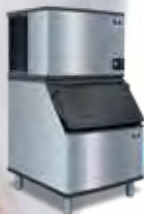
IF0300* D-400 Bin