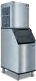
RNF0320 D-420 Bin