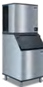
IT0500 D-400 Bin