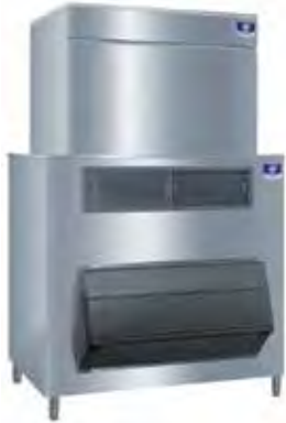
SF/ST 3000 F-1650 Bin