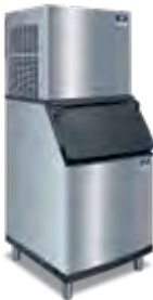
RNF1100 D-570 Bin