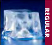
Available on iT0620