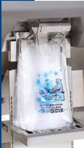
Bags are blown open

Fill 6 to 8 bags per minute. That's 85% faster than manually bagging.