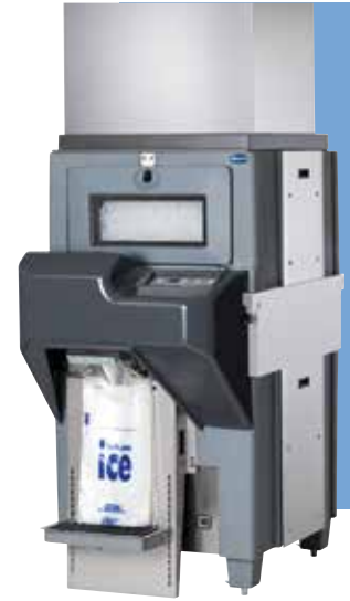
Ice Pro DB650