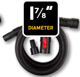
7' Locking Hose WS17820A Locking tab quickly secures