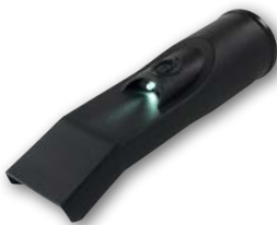
LED Car Nozzles 1⅞" / WS17839A 2½" / WS25039A