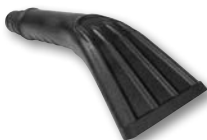
Claw Nozzle Deep and thorough cleaning 1¼", 1⅞", 2½" / WS17840A Not recommended for WS17821A