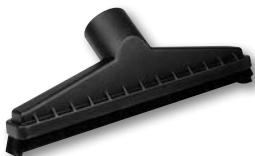
Floor Brush Large area floor cleaning 1⅞" / WS17814A 2½" / WS25014A