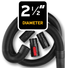
7' Dual-Flex® Locking Hose WS25020A