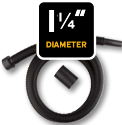
6' Hose WS12520A Fits standard 2½" inlet

The Contractor grade hose is more flexible and four times more durable than a standard hose.