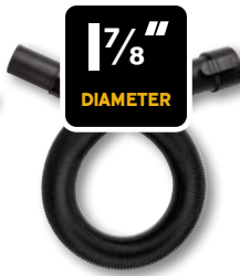
Expandable Locking Hose WS17821A Expands from 2'-7"