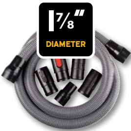
10' Contractor Locking Hose WS17823A