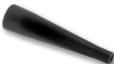
Blower Nozzle Concentrated blowing 2½" / WS25006A