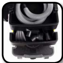
Top View of Storage Drawers

Includes: Vac, Hose, Utility Nozzle, Crevice Tool, Dusting Brush, Wet Nozzle, Claw Nozzle, 2 Extension Wands, Fine Dust Filter