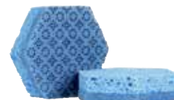
Scotch-Brite™ Low Scratch Scour Sponge 3000HEX