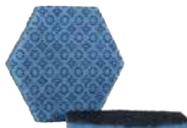
Scotch-Brite™ Low Scratch Scour Pad 2000HEX