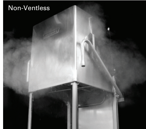
> Until now, high-temp, door-type warewashers required a vent to capture the steam or water vapor emitted when the door is opened.*

This warewasher is not only ventless, but it's also like having two machines in one—one for pots and pans, and one for all your dishware. Whether it's a delicate wine glass or a grimy pot, the new AM Select Ventless is NSF Certified to clean them all. The four washing cycles—1, 2, 4 and 6 minutes, plus condense time—let you select the one that best fits your rack load. Depending on incoming water temperatures, the AM Select Ventless is capable of washing up to 40 racks per hour when using the 1-minute cycle.