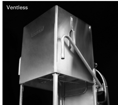
> The Hobart AM Select Ventless has a unique energy recovery condensing cycle, eliminating the purchasing and installation costs of a hood unit for the vent.