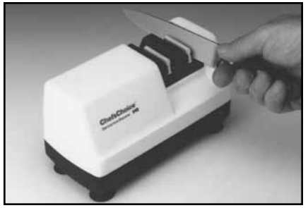
Stage 2. Four (4) to six (6) passes alternating through each slot, (left and right HONING slots). Apply no downward pressure in Stage 2.