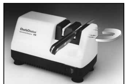
Figure 3. Magnets control the blade angle.