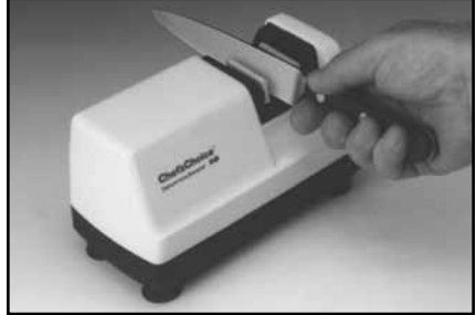
Stage 1. "Breaking-in" knife in Stage 1 will take 15 to 20 passes through each slot, alternating left and right slots. Subsequent resharpenings require fewer passes in Stage 1. Apply light to moderate downward pressure.