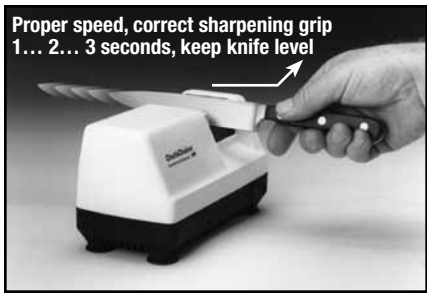
Figure 4. You will find it easier to use a loose grip.