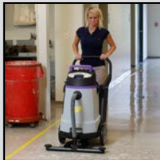
Extreme Weather Condition