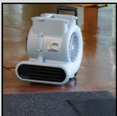
Entryway / Walk Off Mat