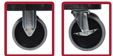
Available with 5" Heavy-duty, 5" Semi-pneumatic, 6" Semi-pneumatic or 8" Fully-pneumatic Casters

2245 Delany Road, Waukegan, IL 60087 800-323-4656 | Fax 847-244-1818 | www.LuxorFurn.com