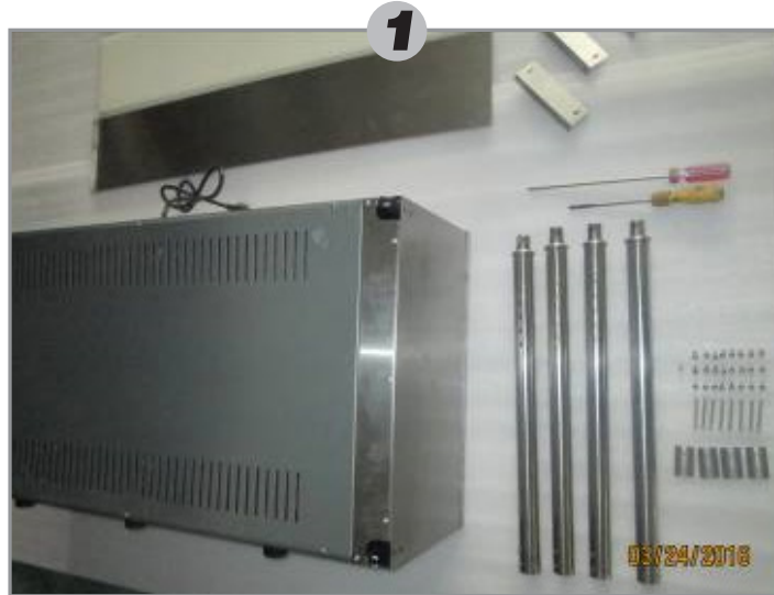
Remove all components from shipping container.