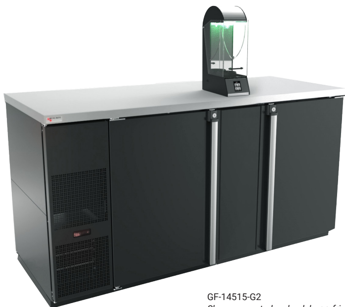
GF-14515-G2 Shown mounted on back bar refrigerator