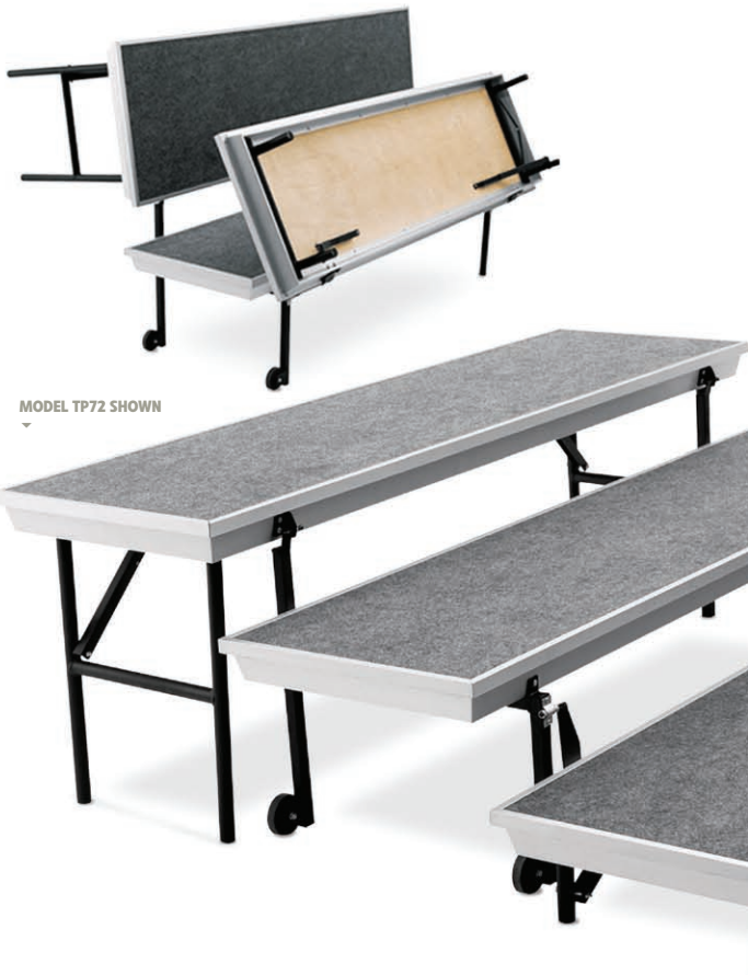
MODEL TP72 SHOWN