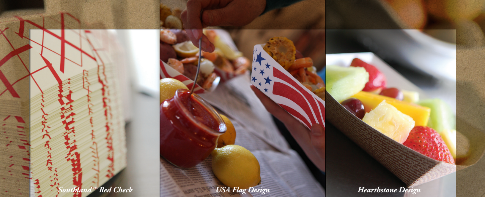
Southland™ Red Check