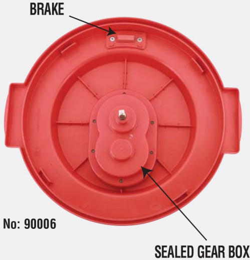
Item No: 90006