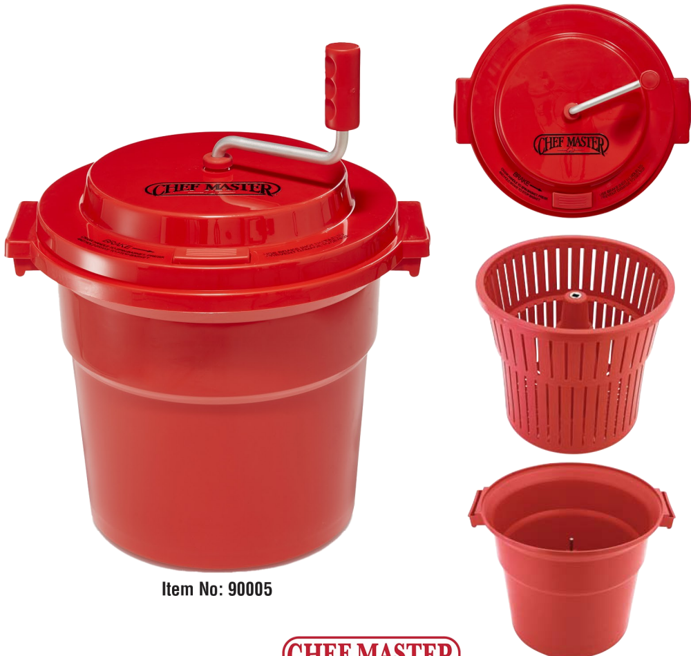
Item No: 90005