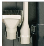
Cleaning accessory pack