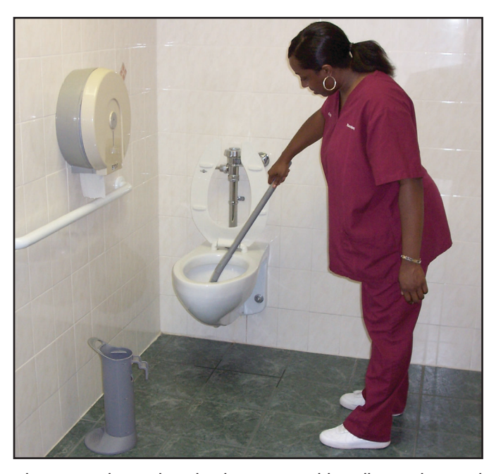
The ErgoToiletBowlBrush's long, curved handle reaches and scrubs all surfaces inside bowl withoutbending or straining.

process. This allowed us to clean faster with less physical strain on our employees. But I knew I wouldn't be satisfied until I replaced all bowl mops for toilet and urinal cleaning. They are simply unsanitary and difficult to use."