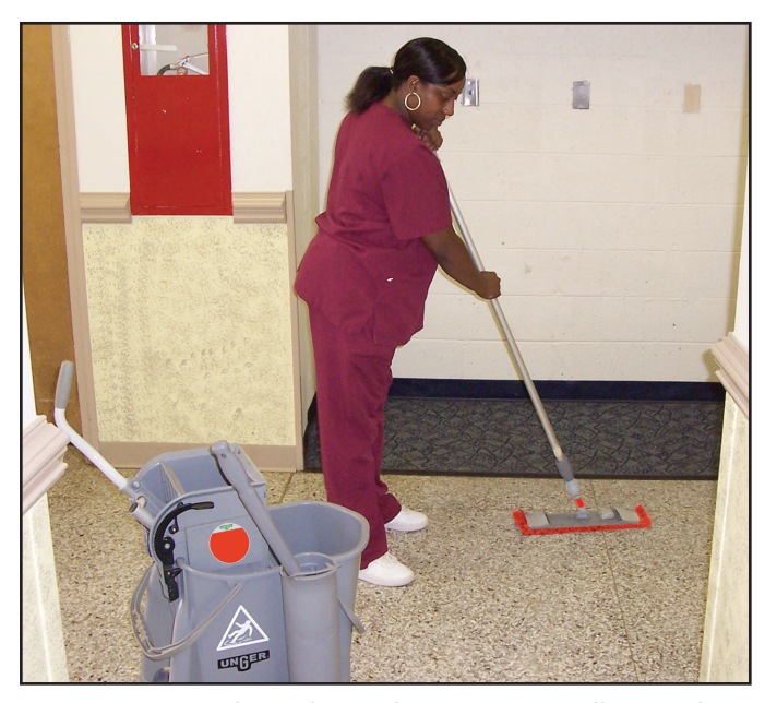
Unger's SmartColorBucket and Mop Systems allow worker's to clean faster with less physical strain.

"Implementing a restroom cleaning system dramatically increased productivity and improved staff morale," Walley said. "For example, the mop system took seven to eight pounds off the mopping