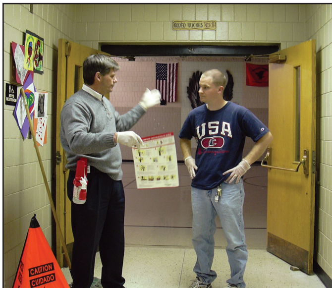
A Custodial Supervisor explains the daily restroom process to a maintenance staff worker.

Studies show that 20 percent of students in middle and high school avoid restrooms because they are dirty. Vandalism, unsanitary conditions and poorly stocked restrooms are among the common complaints.