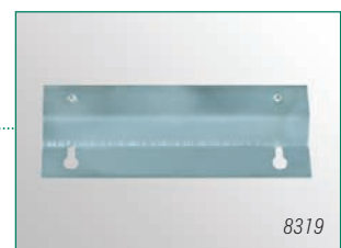
The Mounting Bracket can attach any Wall Hugger™ Receptacle to the wall, suspending it above the floor.