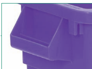
The expanded line of Wall Hugger™ Receptacles now includes a version with molded-in handles for ease of transport.