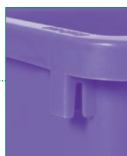
Molded-in Bag Cinch eliminates the need to tie knots in the poly liner to keep it secure around the receptacle rim!