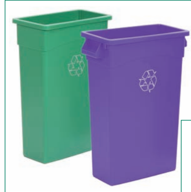
8322 and H8322 (23 gallon) Wall Hugger™ receptacles are available in black, blue and green. H8316 and 8316 (16 gallon) Wall Hugger™ receptacles are available in black.

The Wall Hugger™ line has an updated design that is sleek and attractive. It has also been expanded to include a 16 gallon size which,