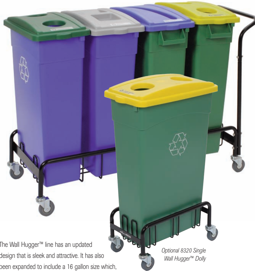
Optional 8320-4 Quad-Collection Wall Hugger™ Dolly