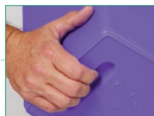
Molded-in hand grips in the receptacle base provide a secure area to grasp when lifting and dumping.