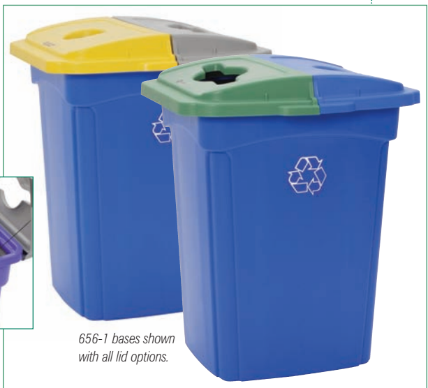
656-1 bases shown with all lid options.