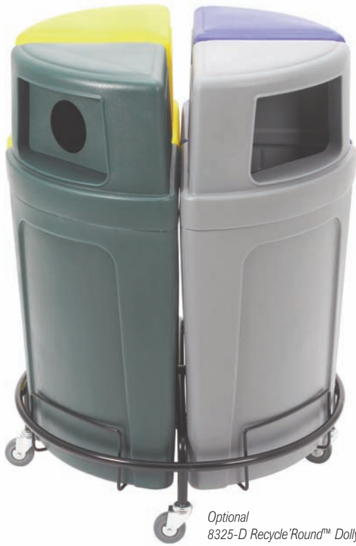
Optional 8325-D Recycle'Round™ Dolly