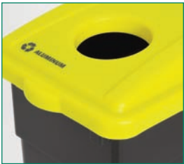
Wall Hugger™ Recycle Lids come with trilingual (Eng/Sp/Fr) "Recycle Material ID Labels" to make sorting easy!