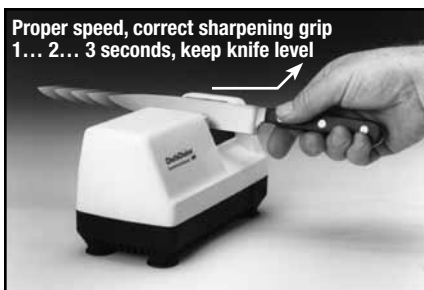
Figure 4. You will find it easier to use a loose grip.